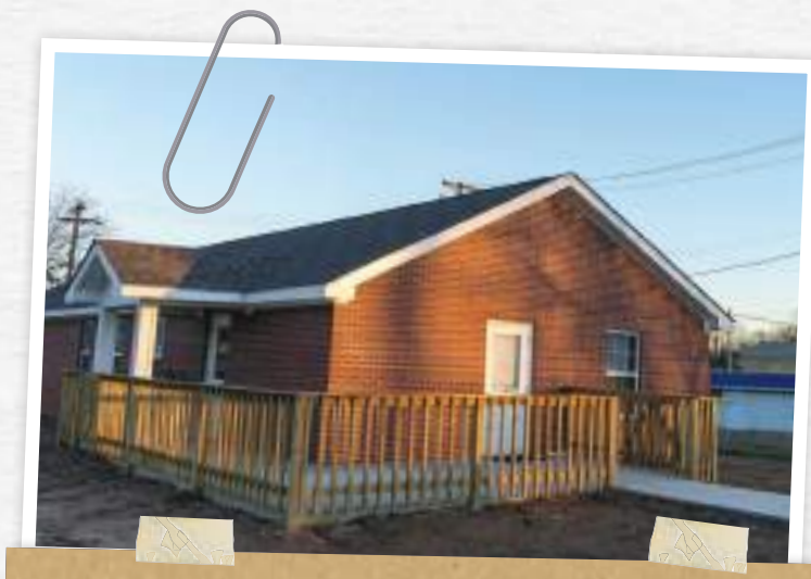
The Hope House - Located at 111 N. Fisher Street | Jonesboro, AR 72401

The Food Bank of Northeast Arkansas is proud to work with the Hope House as they continue their efforts to meet the needs of people in Craighead County. "The services the Food Bank offers allow us to be a greater asset to people struggling," said James.